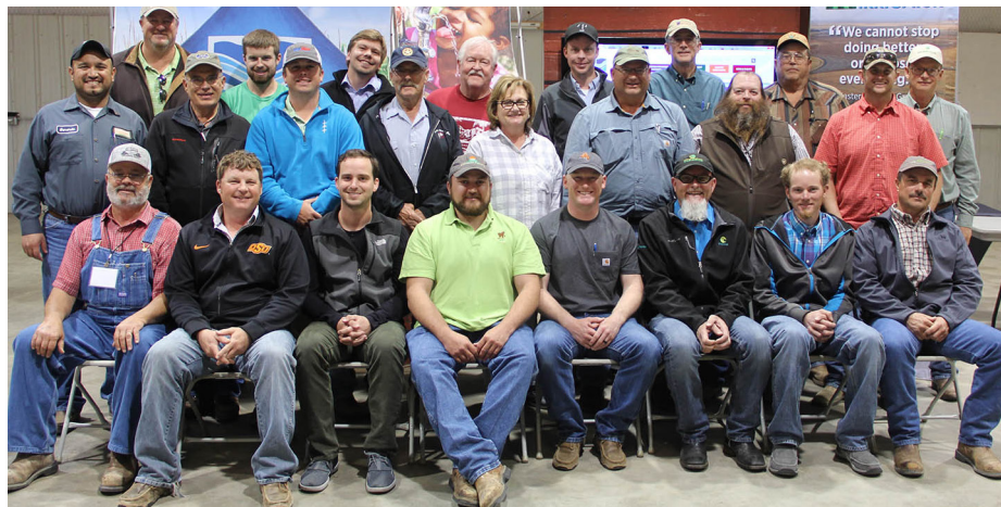
Twenty-four graduates make up the Master Irrigator Class of 2017. Graduates attended four, full-day sessions to complete the course and qualify for a specially designated Natural Resources Conservation Service, Environmental Quality Incentives Program fund.

A second group of truly progressive farmers has completed the course work necessary to attain the distinction of Master Irrigators. The 2017 Master Irrigator graduating class includes 23 irrigating growers from the North Plains Groundwater Conservation District (NPGCD) and an engineer from the USDA's Natural Resources Conservation Service (NRCS). All 24 graduates completed approximately 24 hours of training in the latest irrigation practices and technologies to achieve this recognition, preparing themselves to make the most of every drop of irrigation water they use in their operations.