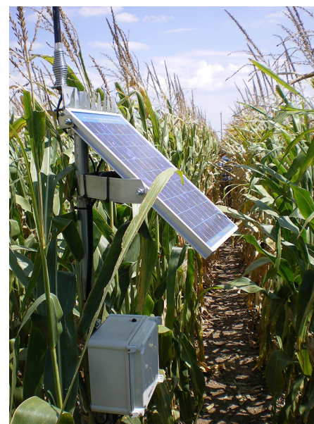
Funds are available for soil moisture sensors through the RCPP.