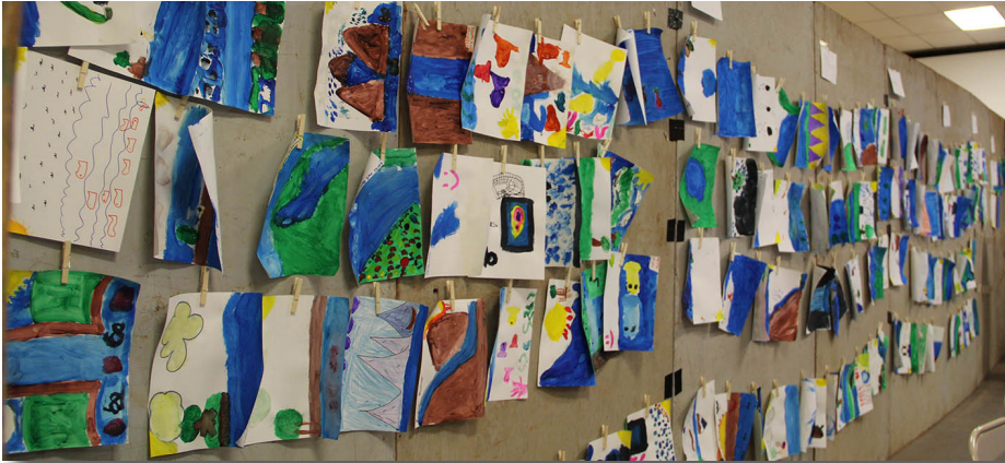
Aquatic Artwork lines the walls of the festival building in Dumas. This activity challenges the students to the listen to water sounds, think about what water means to them, and then express that through art.