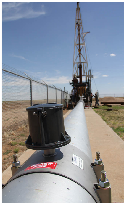
Flow meters, soil moisture monitoring equipment and chemigation valves are funding priorities for the RCPP.