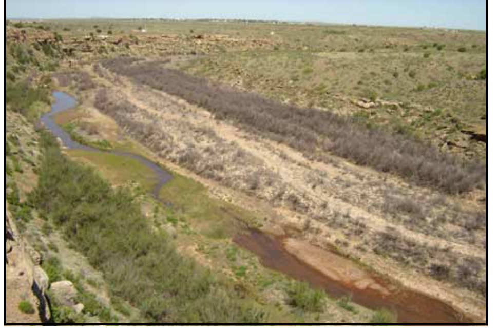
The Canadian River looking west from the Rail Bridge. The top of the picture shows dead Salt Cedar after treatment.