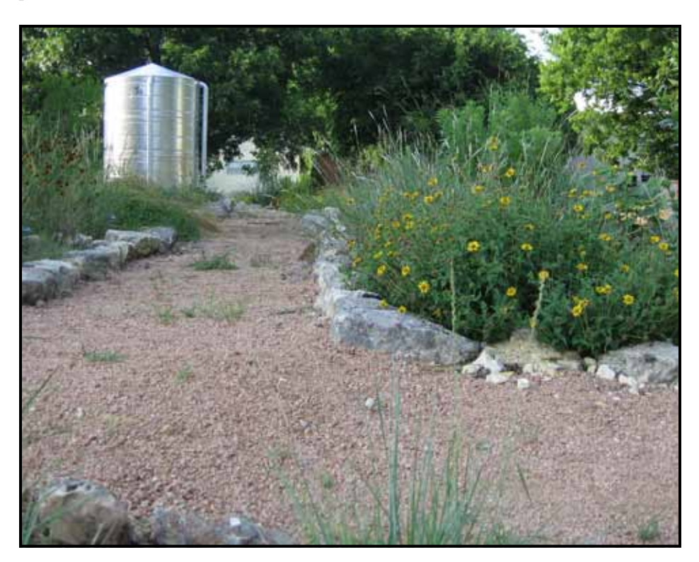
This 2,500-gallon metal rainwater harvesting tank collects rainwater from two downspouts off the Menard City Library in Menard. The water is used to irrigate the 50 plots of native plants common to that region, according to a Texas AgriLife Extension service water resources specialist.

• Texas Manual on Rainwater Harvesting – Texas Water Development Board 3rd Edition